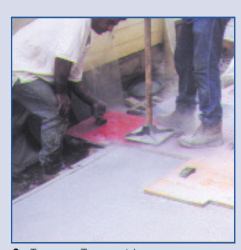
3. Tamp in Texture Mats.

Wall Hugger "Floppy" Mat - A flexible mat with grout lines that bends to reach tight areas.