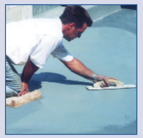
Finish concrete following normal practices, using Bon True Color™ Hardener or Ironoxx™ Integral Color.