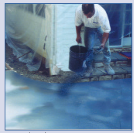
2. Apply Release Agent.