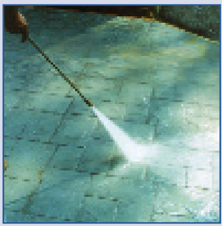
4. Remove excess Release Agent.